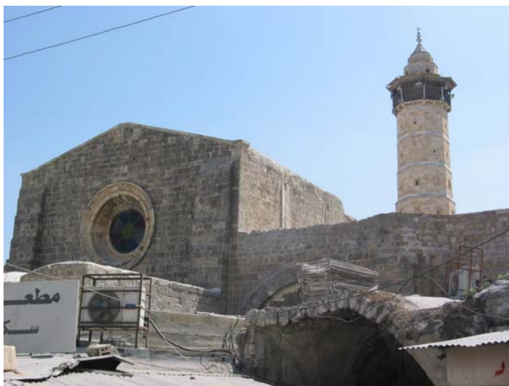
5. Old City of Gaza. Al-Sayed Hashem Mosque.