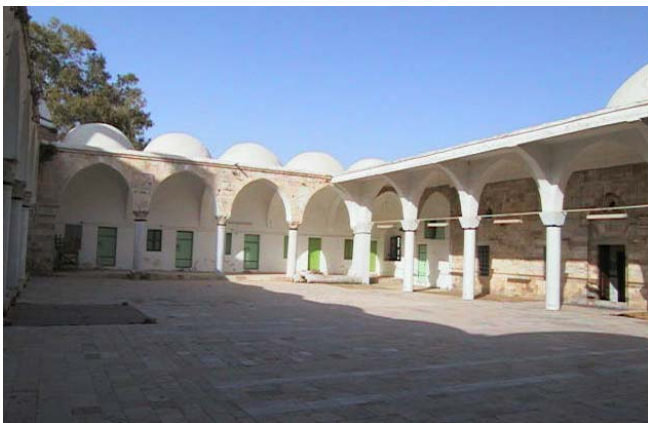
4. Old City of Gaza. Al-Omary Mosque.

The main aim of this Project is to apply recent computer techniques such as, modelling programs, animation software, and web applications to provide users with a navigable format to simulate and document the cultural heritage in Gaza. Because of Political complications and financial resources difficulties, it is much easier to achieve a virtual reservation of these buildings than reconstructing them in reality. Moreover, employing new technology features to conserve and detect historic buildings is not the only issue in this program; but also it will facilitate developing standards and guidelines for data collections and creating of three dimensional models, as well. These created guidelines and standards will enhance the collaboration between 3D modellers, on