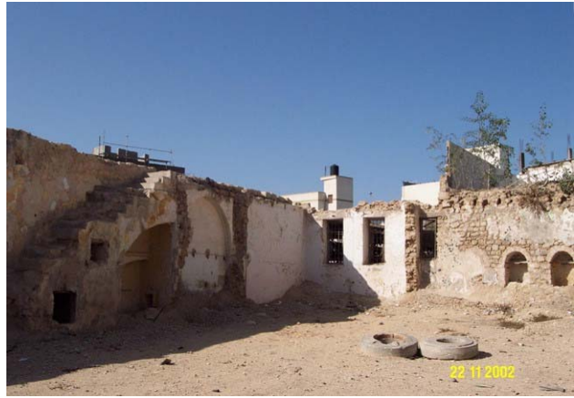
2-3. Destruction and improper use of Gaza historic buildings.